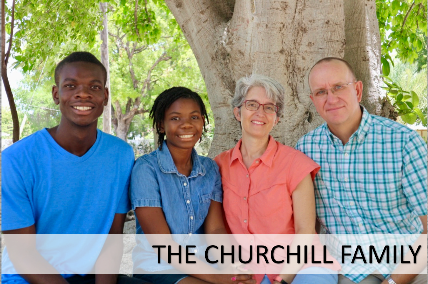
THE CHURCHILL FAMILY